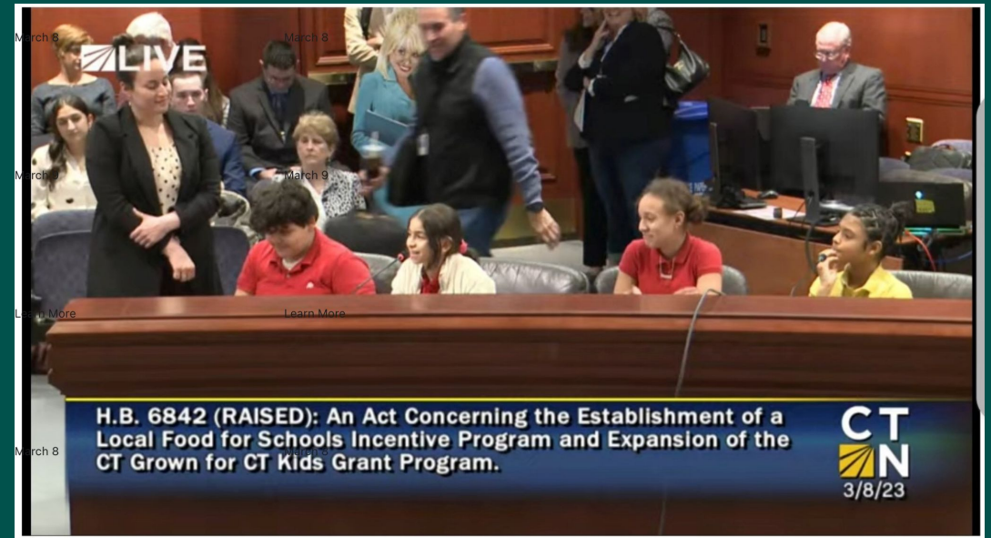
New Britain Students testify for farm to school Feb 2023