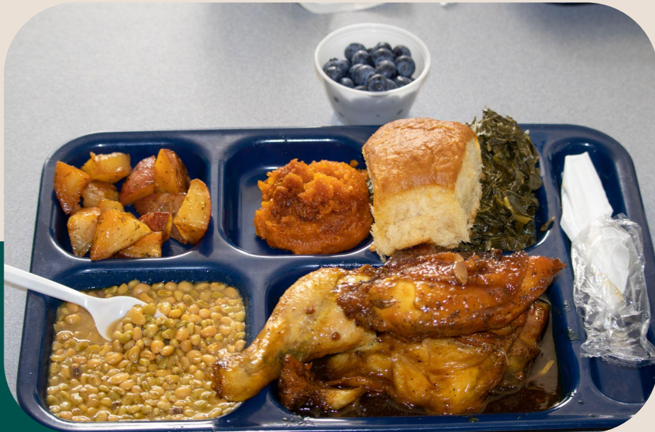
Delicious and nutritious school lunch. (Waynesboro, GA)